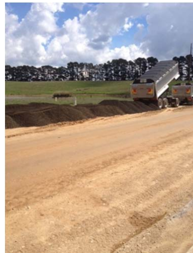
O'Connell West Project