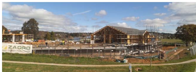
Construction of the Columbia Homes Aged Care Facility

This SoE Report covers the entire catchment and contains information about environmental issues across the catchment, ranging from water and air quality to noise pollution and bio-diversity.