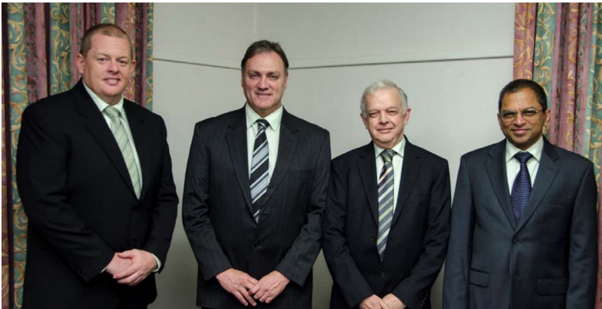
Executive Management Team Left to Right