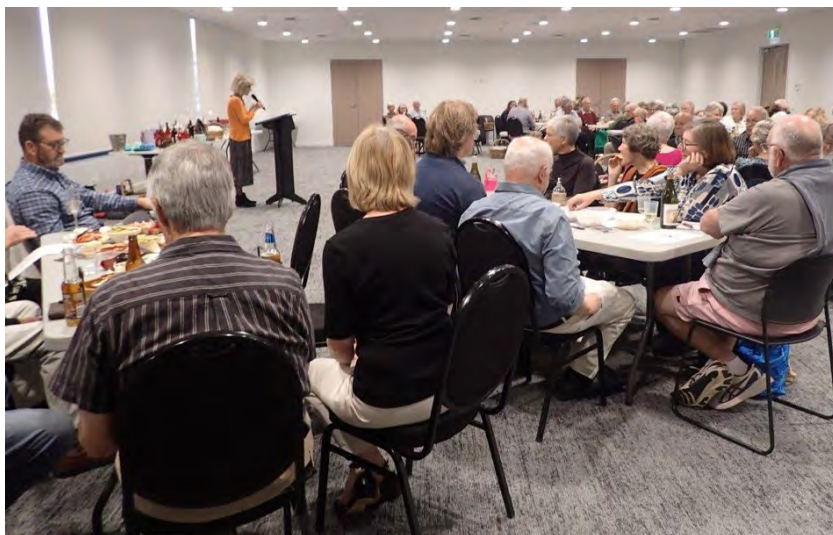
Oberon U3A Trivia Night raises $1000 for Dementia Australia

and Food Safari, just to name a few. We have a group fondly called "The Rusty Restorers" who work at the District Museum each Wednesday morning restoring smaller museum items and large pieces of equipment. You can see the restored black and red steam engine as you drive along Lowes Mount Road – just one of their many projects.