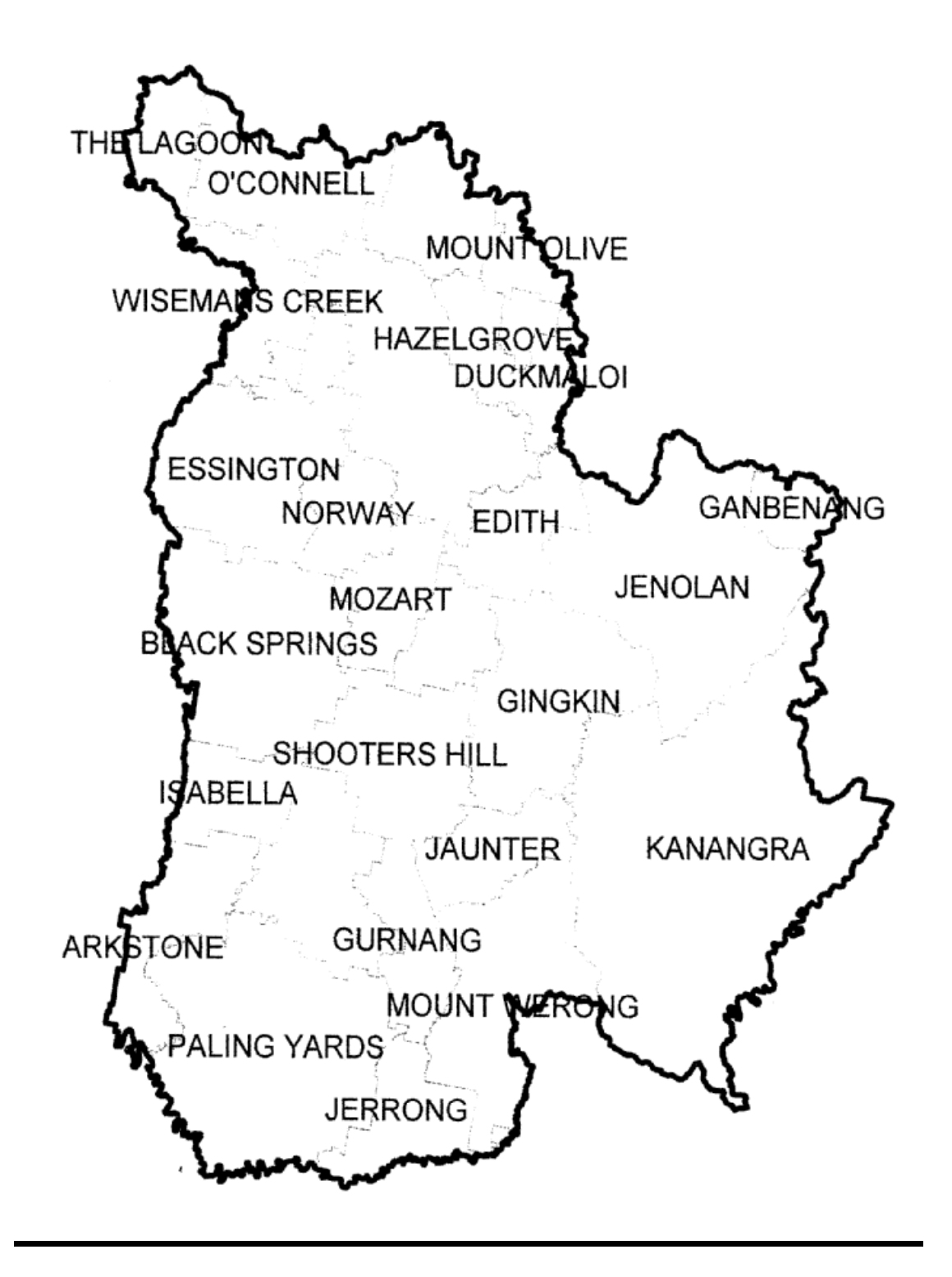
Oberon Shire with Localities