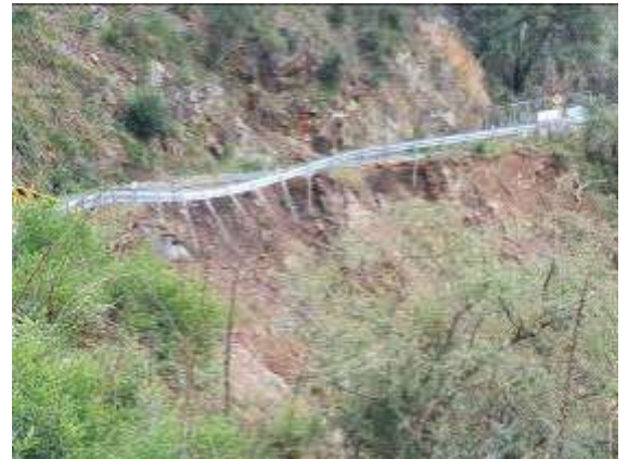
5 Mile Damage

Further down Jenolan Caves Road at the Five Mile Hill there has been catastrophic damage to the road in one place and substantial damage in other spots. This damage occurred in early 2021. TfNSW does expect to be able to partially remediate the damage, but it does not expect to ever restore the road for normal traffic (large buses and large numbers of cars) to or from Jenolan Caves.